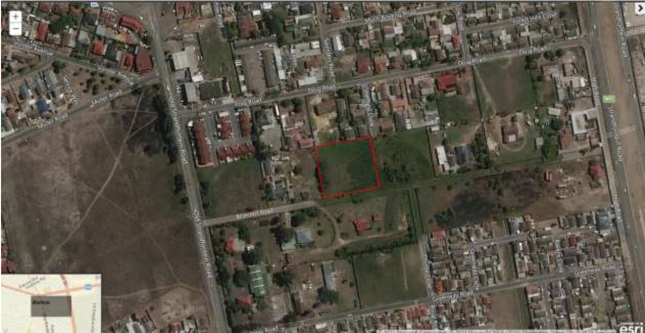
Figure 1: Location of Erf 511, Wetton, Cape Town. The site is indicated by the red outline.