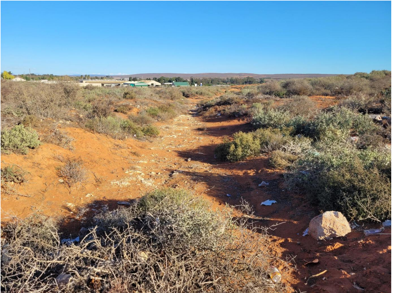
Photograph 2: View of the upper catchment of the non-perennial river.