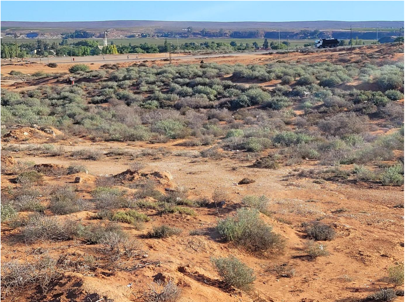
Photograph 4: View of non-perennial river from proposed storage tanks with R362 road in background.