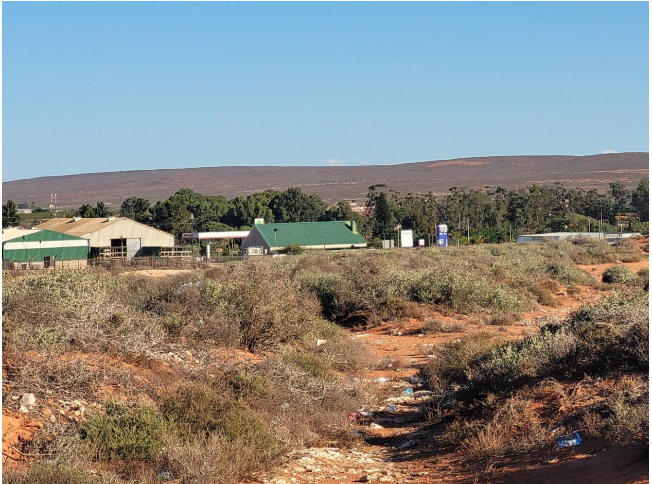
Photograph 3: View of non-perennial river. Proposed fuel storage tanks between the green roofs in background.