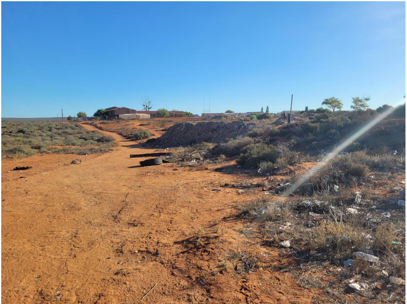
Photograph 1: View of upper catchment of original non-perennial river.