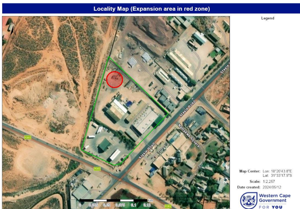
Figure 1: Locality map of the facility (development area outlined in red).

The applicant, Agrimark (Pty) Ltd, proposes to expand their site by adding three 83m 3 (249m 3 ) above-ground diesel storage tanks in the northern section, as outlined in the attached Site Development Plan (SDP) (Appendix I). This expansion will include the construction of a bund floor with new stairs (covering 1.14 m 2 ), a new petrol dispenser area (22.5 m 2 ), a spill slab (120 m 2 ), and an additional bund floor area (237.17 m 2 ). The total area covered by the expansion will be 380.81 m 2 . The site located on Erf 601, Stasie Road, Lutzville, in the West Coast District, spans a total area of 17,130.38 m 2 . Currently, existing developments occupy only 17.57% of the site, covering 3,009.7 m 2 . The infrastructure on the site includes a fuel service station with a forecourt area, a convenience store, a gas storage facility, a mini substation, an Agrimark retail store, and two Agrimark warehouses. Additionally, the site features 80 designated parking bays for visitors and staff.